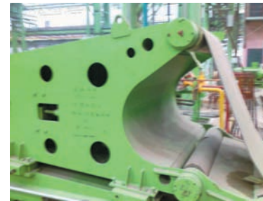
Coil wrapper for Tonggang Iron & Steel Co., Ltd.