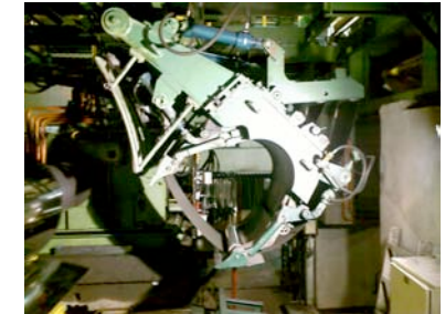
Coil wrapper for Baotou Iron & Steel Co., Ltd.